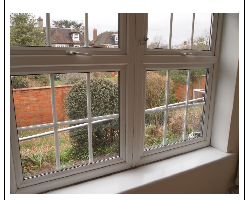
View from the bedroom window