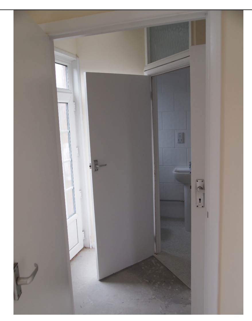
Rear hall showing the back door